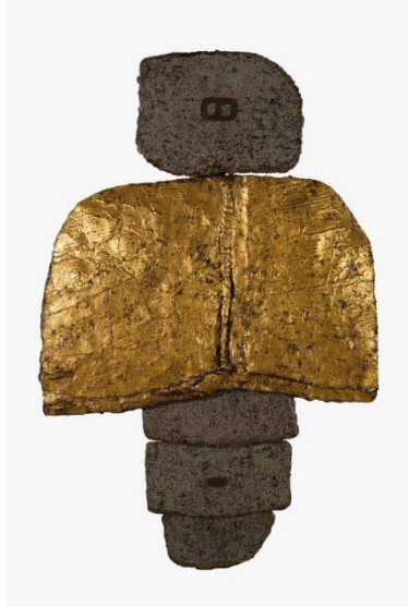
© Sin Sin Fine Art, Untitled 4, Chinese lacquer, old rice bag, gold leaves, oxidized iron powder, 75.5 x 49 cm, 2021

“Retrospective (2012-2022) Wensen Qi (Vincent Cazeneuve)” showcases Wensen Qi’s work with mixing elements of Western modern art into Chinese lacquer traditions.