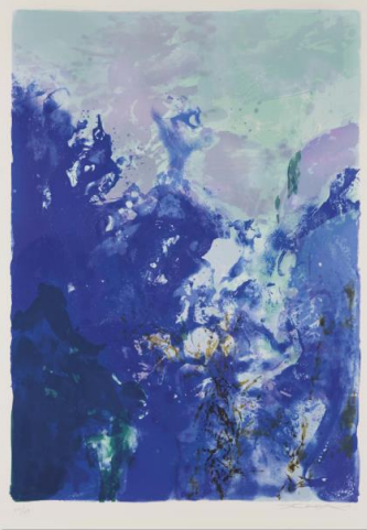
©Zao Wou-ki, Suite Olympique Centennial, 1992, 75.2 x 53.5 cm