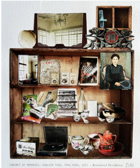
© Daphné Mandel, Cabinet of Memories, Kowloon Tong, Hong Kong 2022 - Abandoned Residence, 2022, mixed media on paper, 20 x 16.5 cm